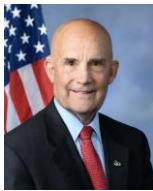
Keith Self ( incumbent )

Bio: Currently serving as the U.S. representative for Texas's 3rd congressional district and army veteran