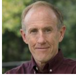
Gary Gates (incumbent)

Bio: Current Texas State Representative for HD 28 and businessman